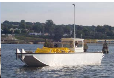
"CAPT. OLE" 34' TWIN O/B