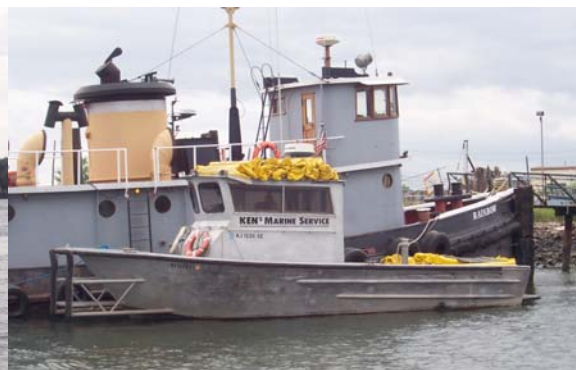
"GABRIELLE" 30' TWIN DIESEL