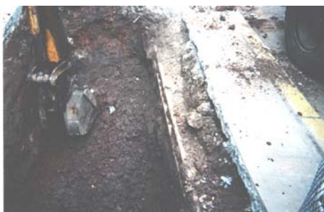
Excavation of UST site

Ken's Marine Service is certified by the New Jersey DEP to do UST closures. We specialize in small business and residential tank services. We handle tank removal and permitting. We provide sub surface evaluation and site contamination surveys. We also do installation and maintenance of ground water remediation systems.