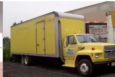
SPILL RESPONSE BOX TRUCK