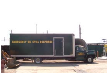
SPILL RESPONSE BOX TRUCK