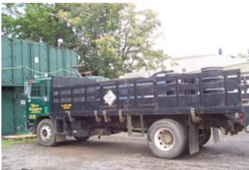
20' RACK TRUCK