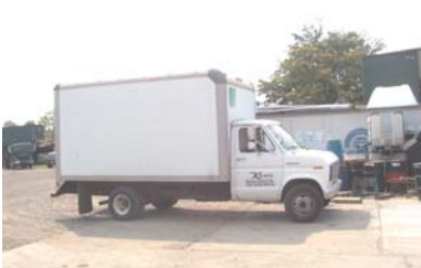
CUBE BOX TRUCK