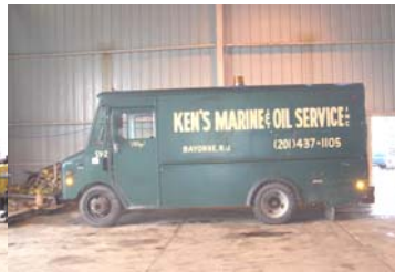
MOBILE WELDING SUPPORT VAN