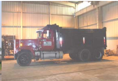
15 YARD DUMP TRUCK