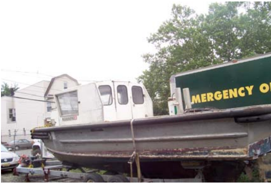
“25’ THOMAS MARINE DIESEL”

Bayonne Lineboat Service, Inc. a division of Ken's Marine Service, Performs the Linehandling duties at all the terminals, refineries and facilities in New York Harbor. This is a 24 hour a day / 7 day a week operation. We have a highly experienced crew in tie-ups and let goes of all type of vessels and barges. Some of our terminal clients include Amerada Hess Bayonne, Gordon Terminal, Conoco Phillips at Bayway and Tremley Point, KMI Carteret and OB, Motiva Sewaren, Vico and the NYC Passenger Ship Terminal to name a few. For further information, Please contact us at 201-436-8109 or Fax us at 201-436-8456.