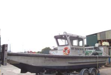
"SILVERSHIP" 25' O/B