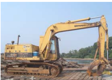
CAT 215 EXCAVATOR