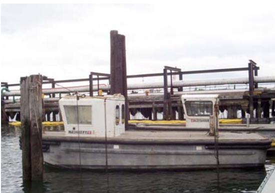
“25’ PATRIOT DIESEL”