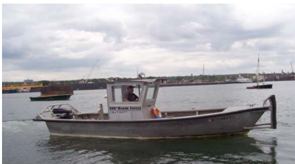
"JOYCE" 24' O/B