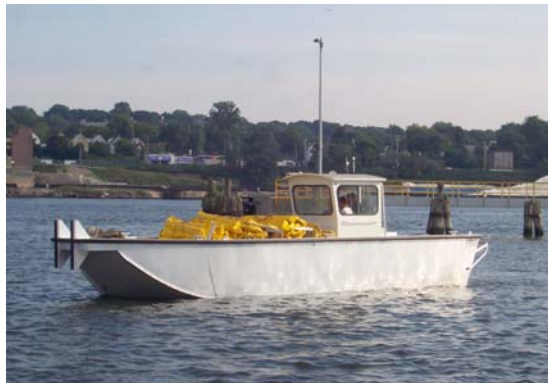
Oil Spill Response Vessels