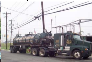
*6000 Gallon Vac Truck