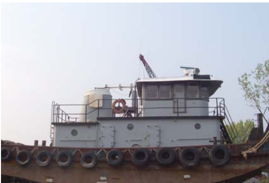
DURHAM 56' TWIN SCREW PUSH TUG