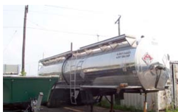
*6200 Gallon S/S Insulated Vac Truck