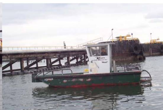
"NOEL" 19' O/B