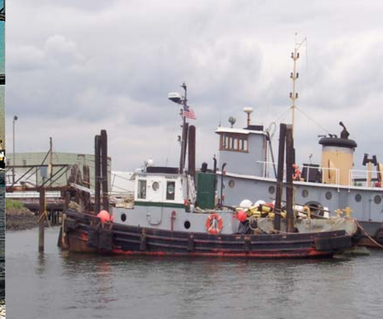
ROBINS REEF 42' TUG