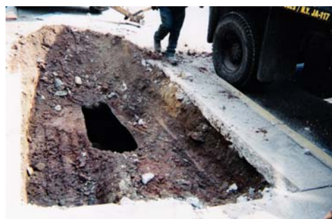
Inspection of tank before removal