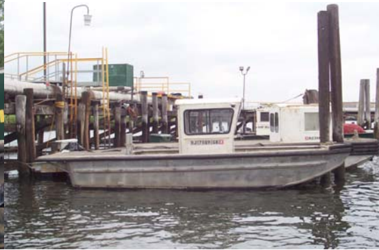
“22’ PATRIOT I/O”