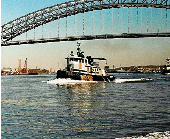
BERGEN POINT 60' TUG