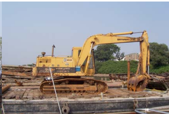
DECK BARGE WITH EXCAVATOR

Ken's Marine has available deck barges for all applications.