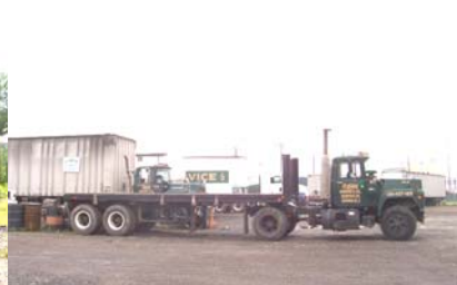
FLAT BED TRAILER