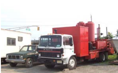
DRUM VAC TRUCK