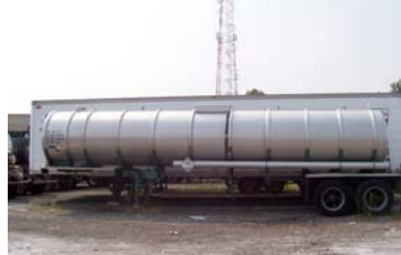
*7200 Gallon S/S Tank Truck

Additional Units - *2 – 2100 Gallon Vac Trucks