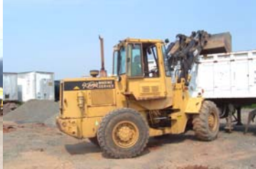
IT 28 PAYLOADER