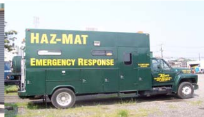
HAZ-MAT RESPONSE TRUCK