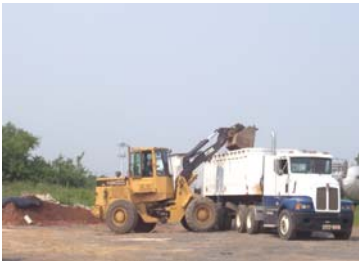
PAYLOADER & TRAILER