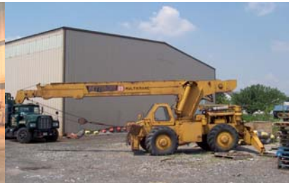
15 TON PETTIBONE CRANE