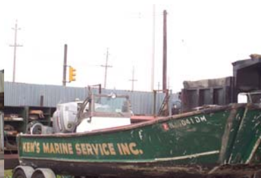
"MELANIE" 22' O/B