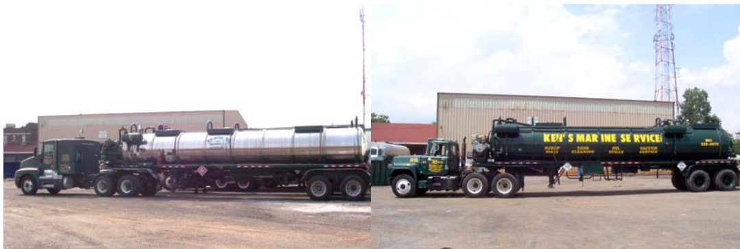
* 2 – 5000 Gallon Vac Trucks