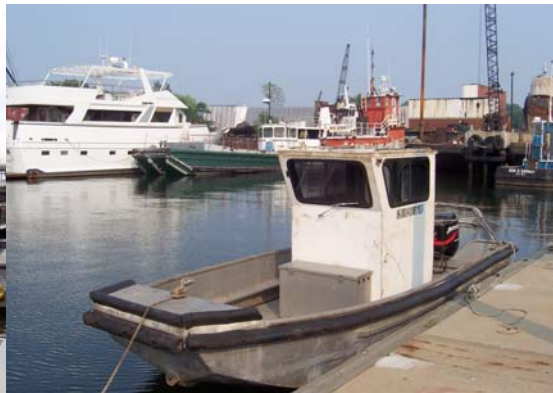
“20’ PATRIOT O/B”