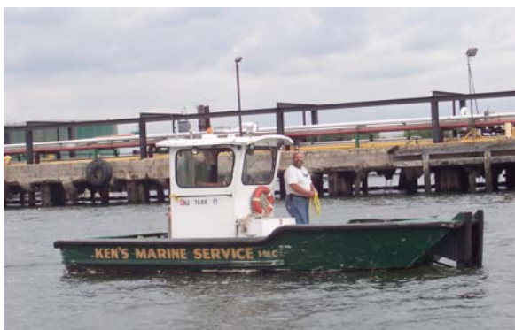
"MELISSA" 22' DIESEL