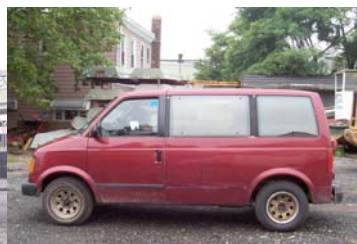
CREW TRANSPORT VAN