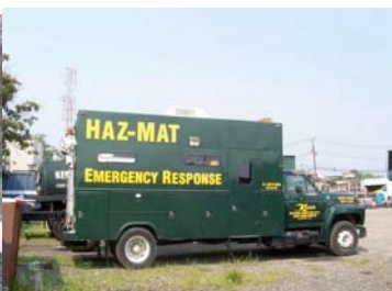
Haz-Mat Response Truck