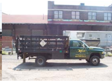
14' RACK TRUCK