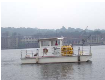
"RESPONDER" 30' GAS I/O