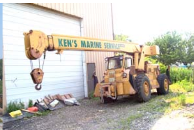
14 TON GROVE CRANE