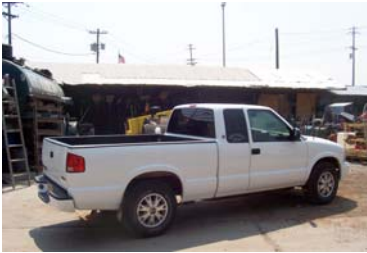
CREW TRANSPORT P/U