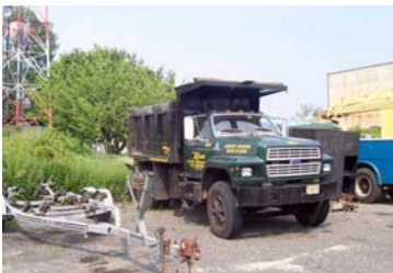
6 YARD DUMP TRUCK