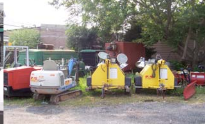
MINI BACKHOE & PORTABLE LIGHTS