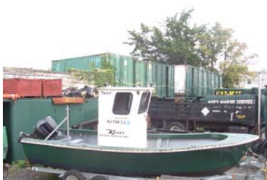
"TESS" 22' O/B