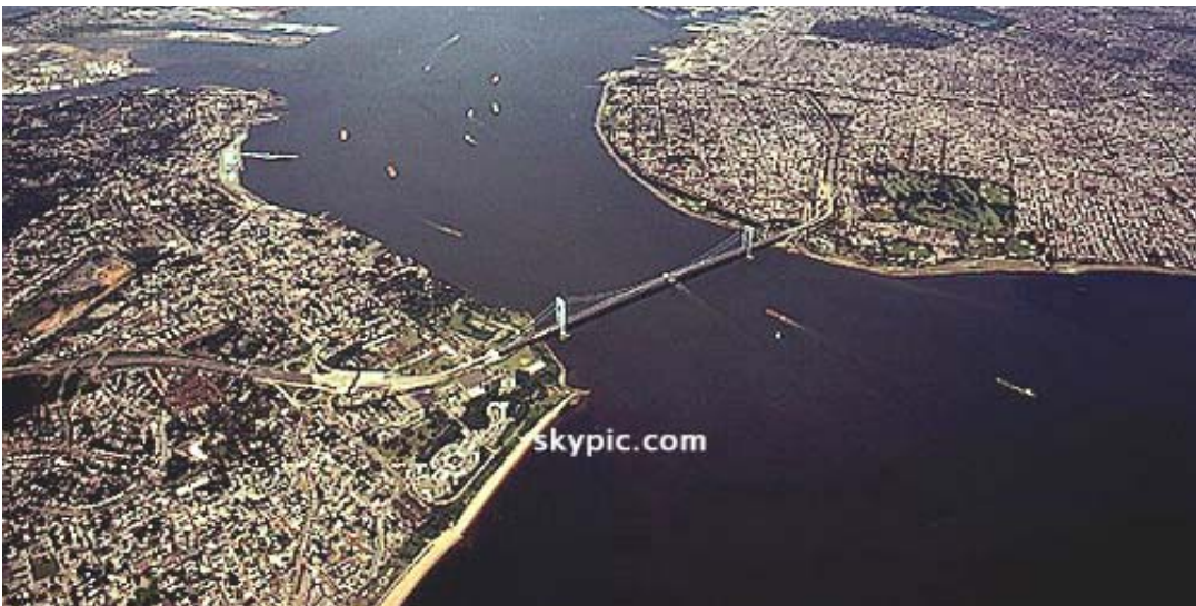
UPPER NEW YORK HARBOR (TOP) & GRAVESEND BAY (LOWER RIGHT)