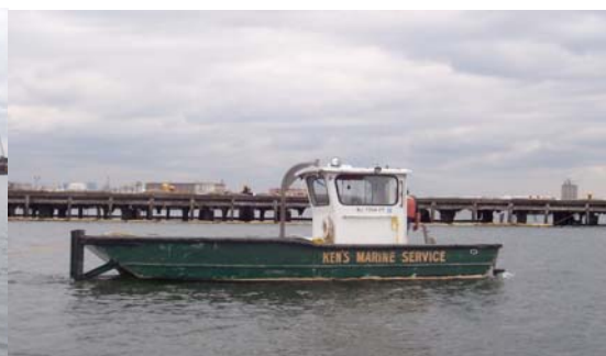
"RENEE" 25' DIESEL