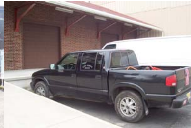
H/D TRANSPORT P/U