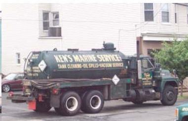
*2 – 2500 Gallon Vac Trucks