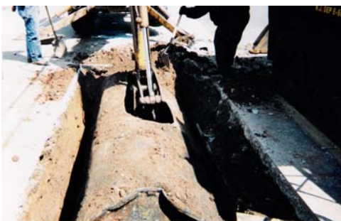
Removal of old tank