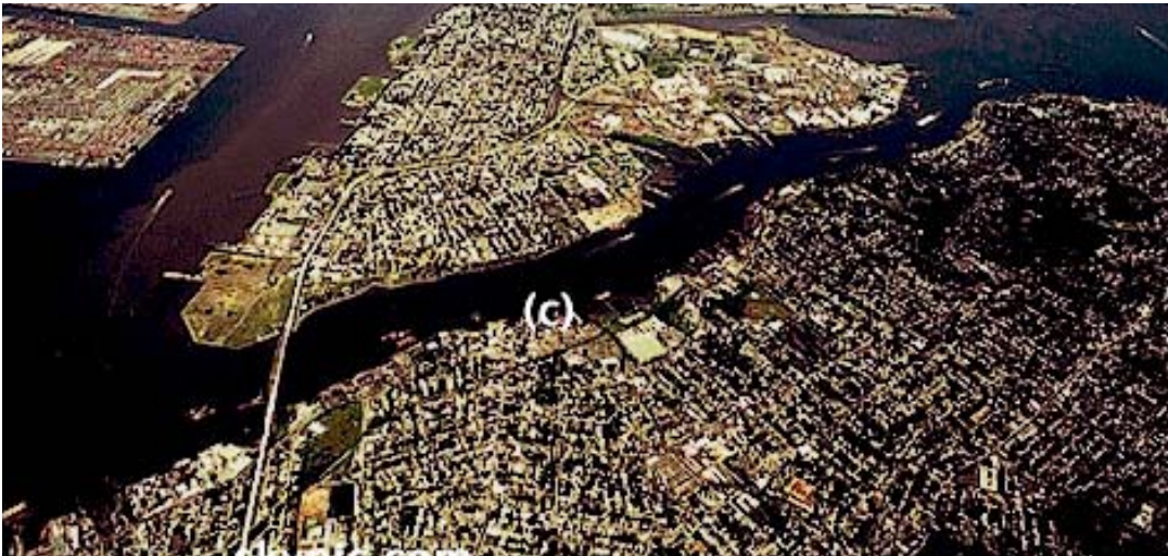
BAYONNE, NJ (TOP) & STATEN ISLAND, NY (BOTTOM)