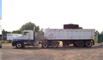
27 YARD DUMP TRAILER