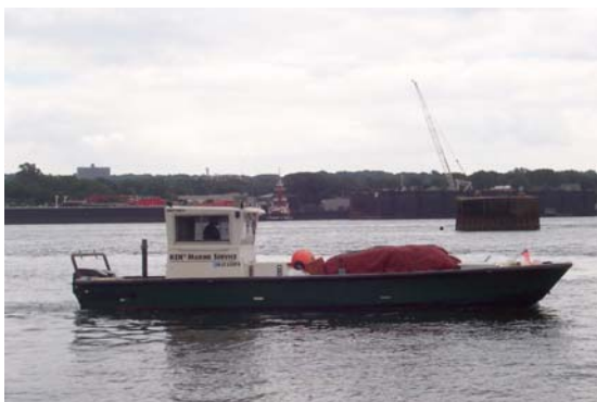
"BRITTNEY" 34' TWIN O/B