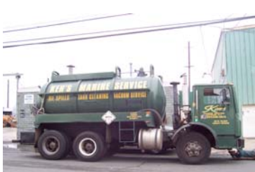
*3000 Gallon Vac Truck